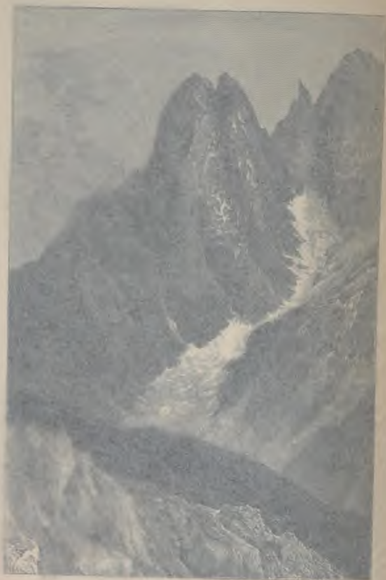
THE MOUNTAIN OF ARARAT FROM THE SOUTH